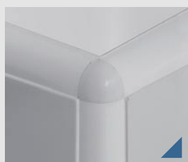
Inner rounded corners