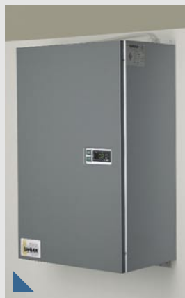
Compact cooling unit