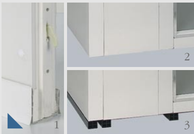
Floor 1. without floor 2. with cold room floor 3. with freezer room floor