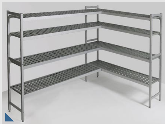
Racks with four shelves