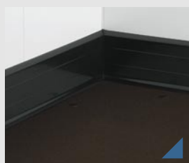
Reinforced floor 9 mm